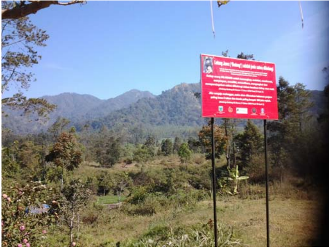
Figure 4. The JLRC (pre-release site) in the foreground and the Coban Talun Protected Forest, including the peak of the Gunung Pusungrawung release site, in the background.

Conservation, Directorate General Forest Protection and Nature Conservation, Ministry of Forestry of the Republic of Indonesia, and the State Owned Forestry Enterprise (Perum Perhutani), Ministry of Enterprise, Republic of Indonesia.