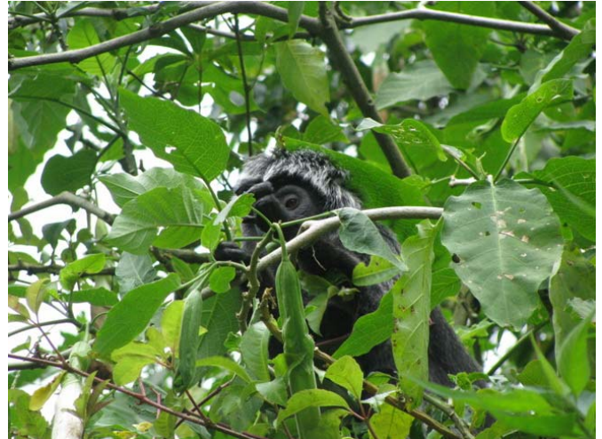
Figure 13. One of the first released group of Javan langurs in Gunung Pusungrawung, feeding on leaves of a Kecubung tree post-release.

hunting, and loss of habitat. Populations of the subspecies occurring in East Java, Trachypithecus auratus auratus , occur in isolated forest fragments, and in many of these appear to be at low densities or in some cases extinct. The Gunung Pusungrawung forest block within the Coban Talun Protected Forest in East Java is one example of a forest fragment where the Javan langur appears to have been hunted virtually to extinction. The project to reinforce the currently very small Javan langur population in Gunung Pusungrawung will not only result in the re-establishment of a viable population at this site, but will also have secondary conservation benefits including increasing the protection of the forest and the Raden Soerjo Forest Park within which it is located, increasing the potential to conserve the species through finding solutions to the illegal pet trade, increasing public awareness of primate conservation issues in Java, and providing opportunities to national students to study issues relative to primate conservation as part of their University training.