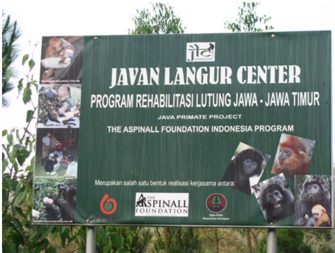
Figure 9. The welcome sign for the Javan Langur Rehabilitation Centre (JLRC), East Java.