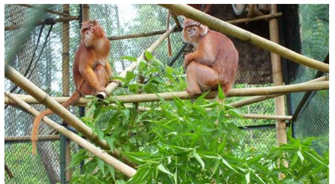
Figure 8. The Javan langurs from UK settling in to their quarantine facility at the JPRC in Bandung, West Java, February 2013.