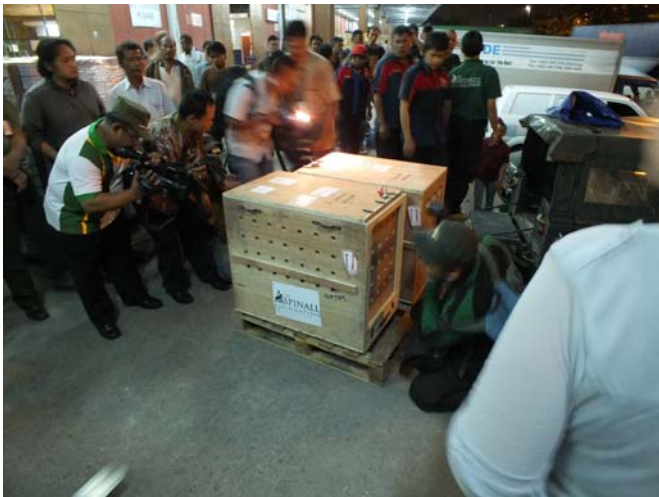
Figure 5. The first group of Javan langurs arriving from UK at Jakarta International Airport, Java, February 2013.