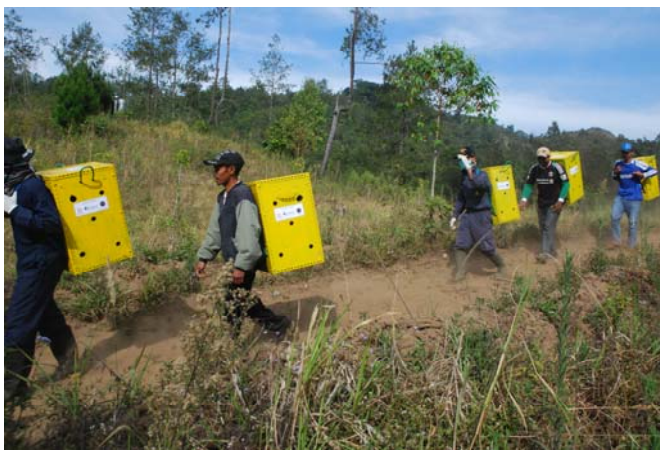
Figure 10. The transport of 13 Javan langurs from the JLRC to the release site one week prior to release, September 2012.