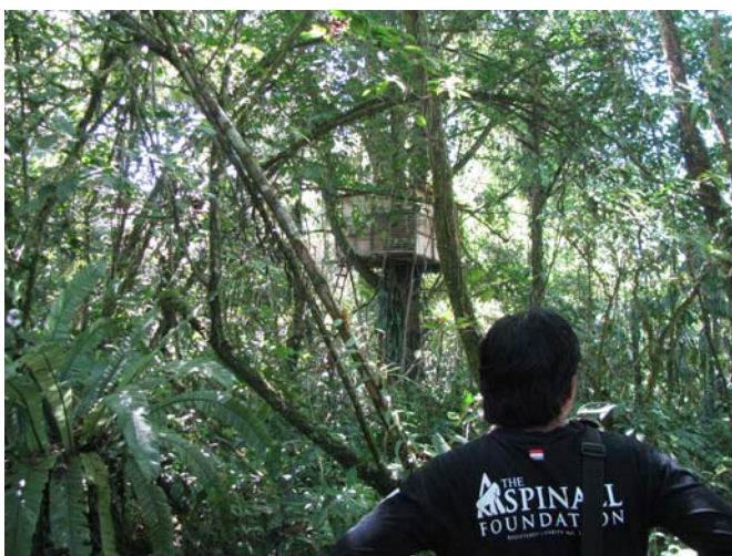
Figure 11. The cage at the final release site used as part of a soft-release process for the first group of Javan langurs released in 2012.

The diet of the langurs during the pre-release phase includes food plants present at the release site. All necessary pre-release procedures, such as final veterinary exams and behavioural observations, are undertaken during the pre-release phase at the JLRC.