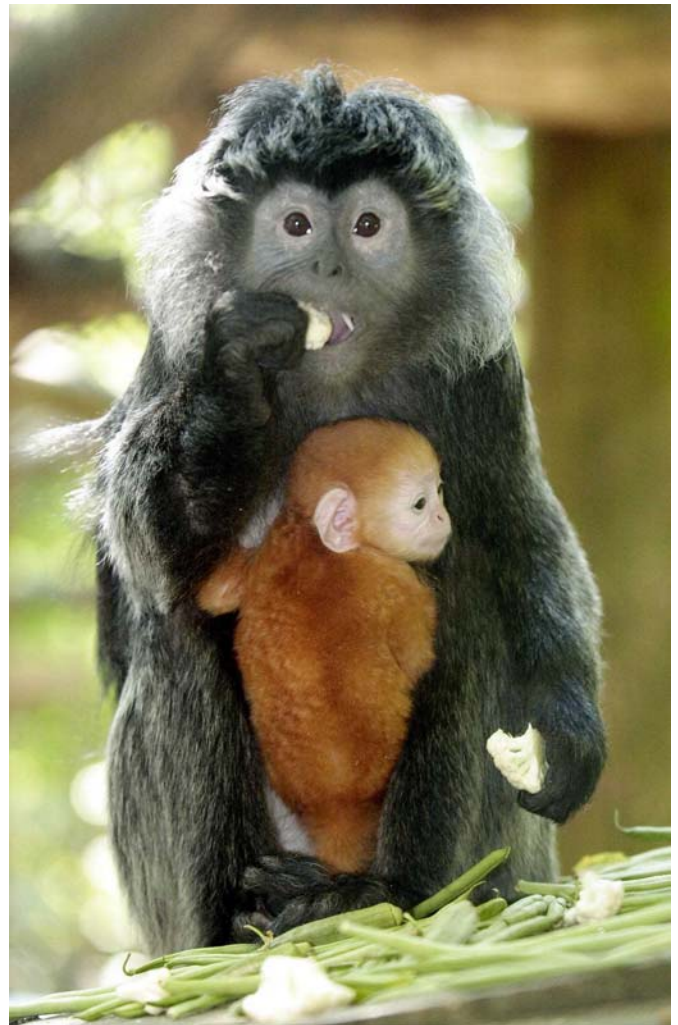
Figure 1. Javan langurs are all born with orange fur, but most turn black at a few weeks of age.

The Javan langur Trachypithecus auratus (Primates: Cercopithecidae) is endemic to Indonesia and is currently considered as Vulnerable by the IUCN (Nijman & Supriatna 2008, IUCN 2012). It is also known as “Javan Lutung” or “Ebony Leaf Monkey” (IUCN 2012), and local names include “Lutung” and