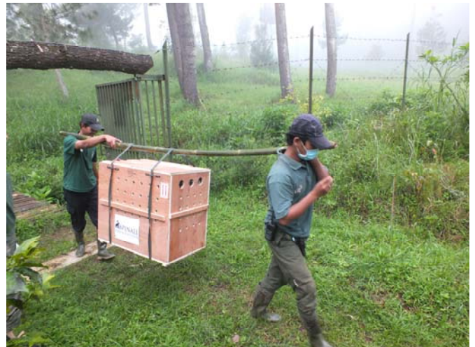
Figure 6. The Javan langurs from UK arriving at the JPRC in Bandung, West Java, February 2013.