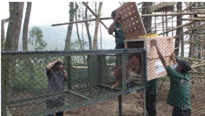
Figure 7. The Javan langurs from UK arriving at their quarantine facility at the JPRC in Bandung, West Java, February 2013.