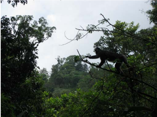
Figure 12. One of the first released group of Javan langurs in Gunung Pusungrawung in March 2013, six months post-release.