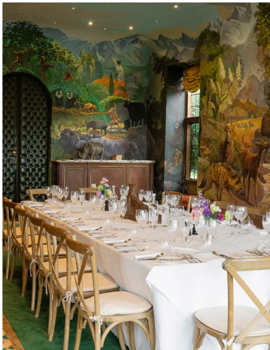
The Spencer Roberts Room