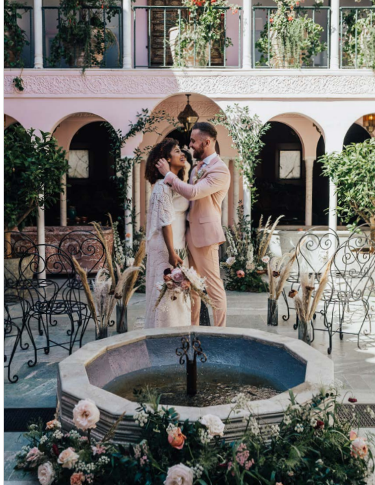
The Moroccan Courtyard